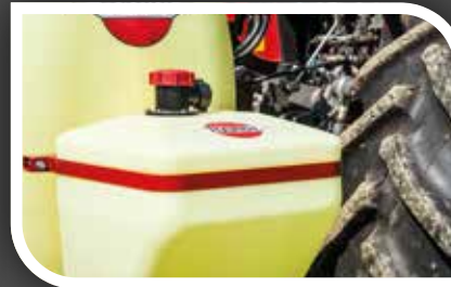
50 l RinseTank