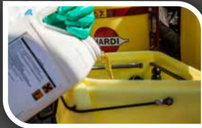
25 l ChemFiller