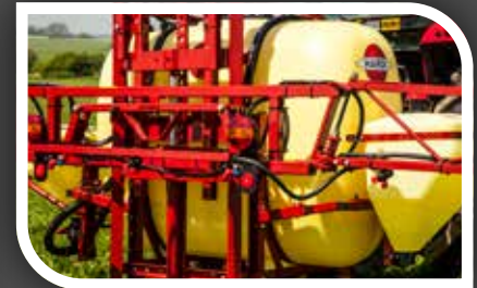
Hydraulic boom lift