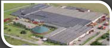
Nørre Alslev, Denmark