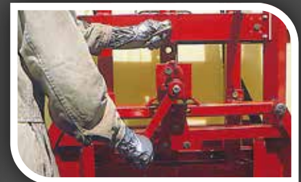
Manual boom lift