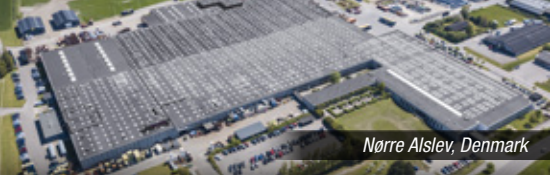
Nørre Alslev, Denmark